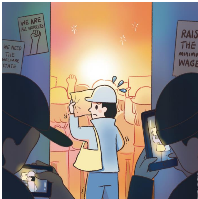
Visual illustration of Posh being followed by undercover police officers during a protest / © Amnesty International / Summer Panadd

Sometimes, two to three officers would wait for him at school and follow Posh around after school. The young activist told Amnesty International that this continuous surveillance led to panic attacks, insomnia, and stress. He needed to move out of his house to avoid the authorities and recover from the mental health problems that the surveillance induced.