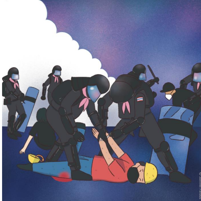
Visual illustration of Sainam’s experience of the violent arrest by police officers during a protest crackdown / © Amnesty International / Summer Panadd

Section 69 of Thailand’s Act on Juvenile and Family Court and Juvenile and Family Case Procedure (“Juvenile Court Act”) prohibits the use of “restraining tools” for arresting children in every case, except if it is of the utmost necessity to prevent the child from running away or to ensure the safety of the child or others. 62 It also requires the officer who arrests a child to inform them of their arrest, as well as charges against them and their legal rights. Amnesty International’s documentation shows that the police officers did not comply with this procedure in the arrest of Sainam.