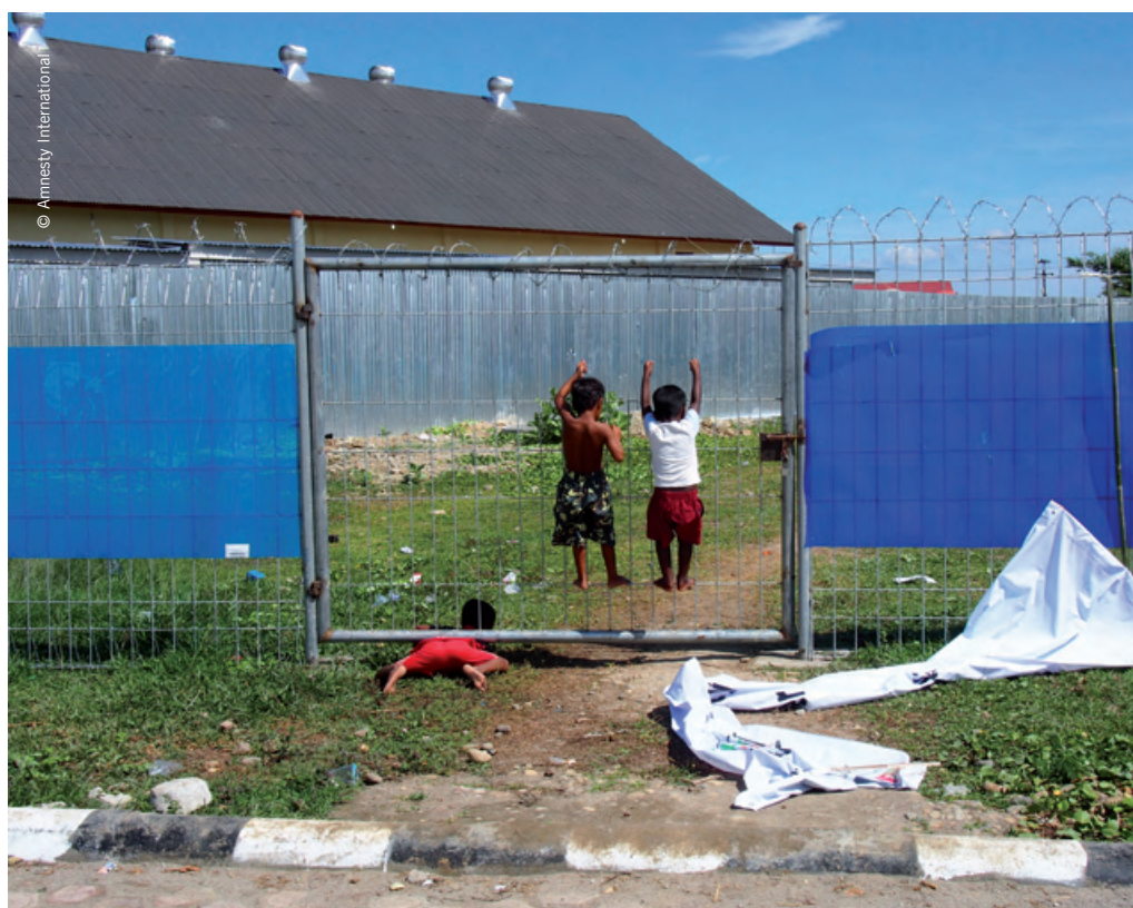
Three Rohingya boys at a shelter in Aceh.

A large proportion of the recently arrived Rohingya are children; of a population of 950 people, 521 – or 55% – are children, and 328 – or 34% – are unaccompanied or separated. 176 Although the sites where the Rohingya are living in Aceh are not officially called detention facilities, in practice the residents’ movements are often restricted and they could be understood as being detained. Amnesty International is concerned at the ongoing detention of any children, as detention is never in their best interests. 177 The long-term effects of immigration detention on children are well known; in one recent study, a third of children detained by Australia were suffering from a mental health disorder requiring psychiatric support. 178