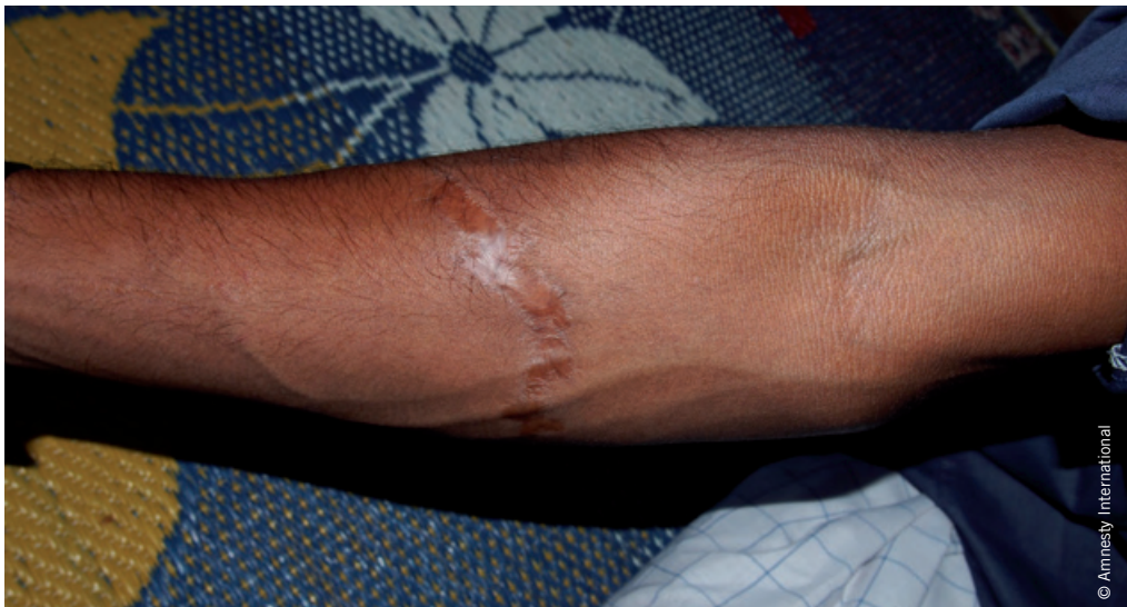
A Rohingya man showing a scar he said he sustained from a knife attack that took place in Myanmar in 2012.

Several interviewees said that their family members were killed and/or disappeared during the 2012 violence. A Rohingya businessman from Molek told Amnesty International that his 50-year old aunt was killed by police in June 2012; an eye-witness told him that she was stabbed with a knife in her side, and her body was taken to the monastery but never released to her family. At around the same time, his two teenage nephews were captured by a mob and never seen again. He called the police to inquire about his nephews' whereabouts, but the officer told him: " Kala , I cannot do anything for you." 31 A 19-year old woman from Sakki village said that in June 2012 her husband received knife wounds during the attacks, and she believes he died: "We cannot find his dead body. It disappeared." 32 A woman from Santolli village told Amnesty International that her eight- and seven-year old children disappeared during the June 2012 violence; she fears that they are dead, saying: "I never saw their bodies." 33